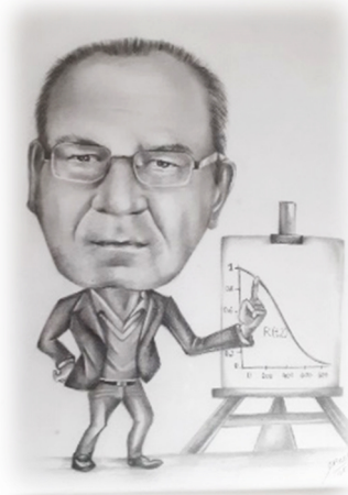
Portrait by MSc Students, 2019